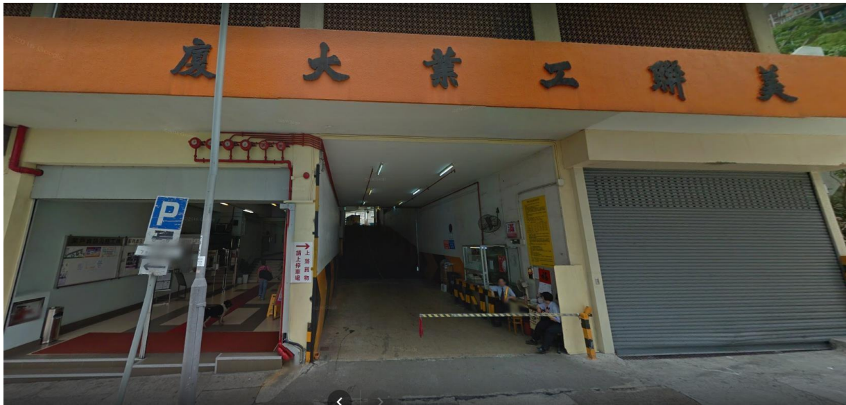
Mai Luen Industrial Building

Leave Kwai Hing Station from Exit A, cross Kwai Hing Road, across Kwai Chung Road using the bridge, walk along Kung Yip Street for about 5 minutes.